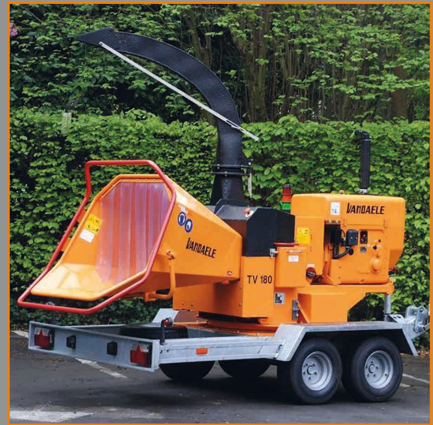
TV 180 D

The middle-class models for real professionals