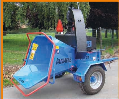
Transparent flaps in the funnel.