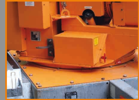
Machine on turntable.

Comb in the top cover/ discharge chute for calibrated chips.