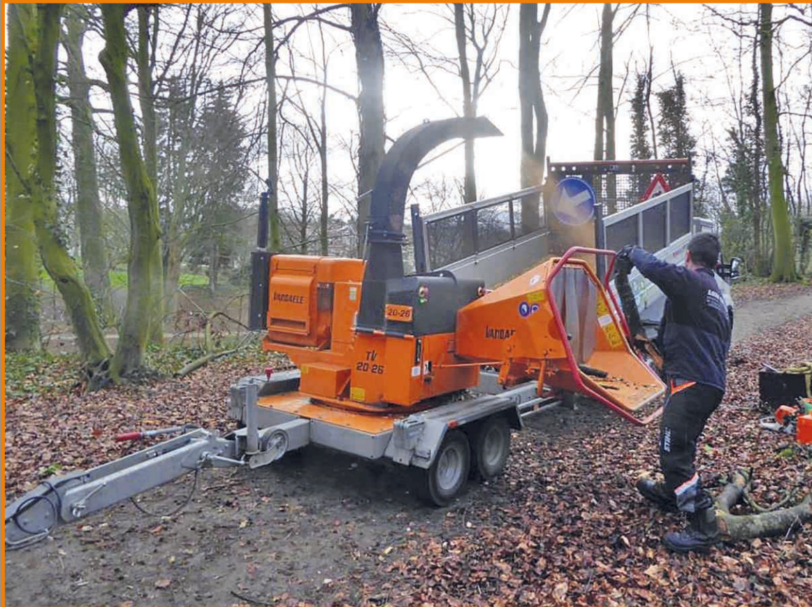
TV 20-26 D