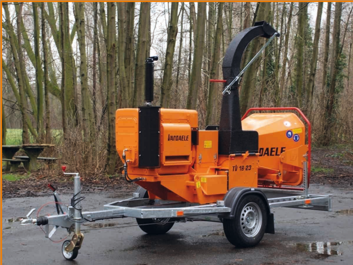
TV 18-23 D Compact 18 cm machine