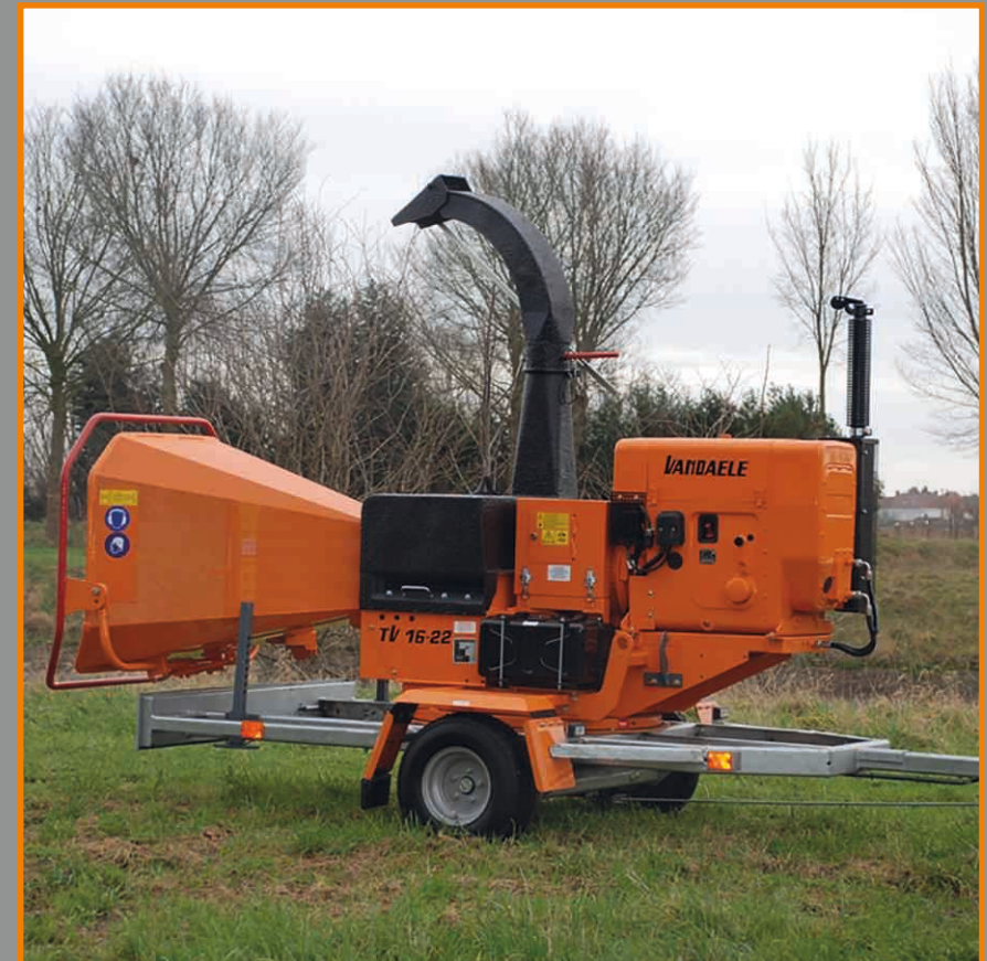
TV 16-22 D Powerful and robust “workhorse”