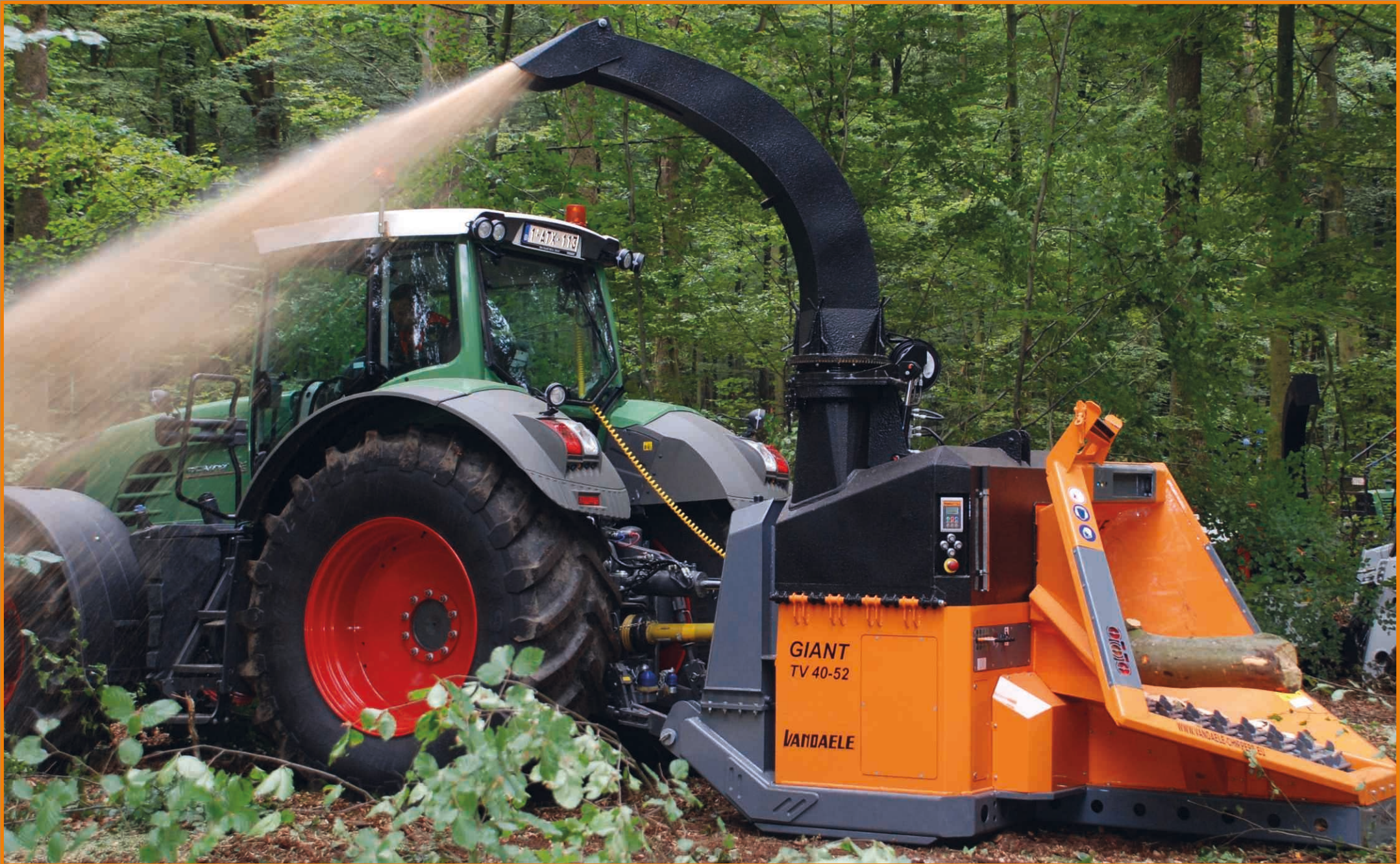
TV 40-52 "GIANT" The Giant in the Vandaele range