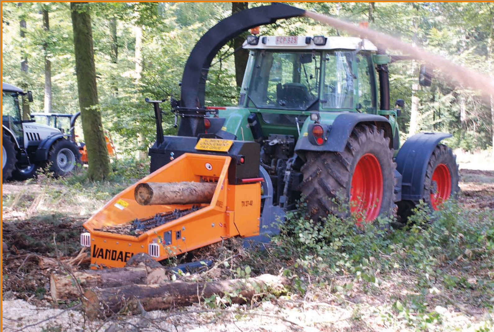
Machine for crane feeding TV 27-40 PGAC with chain conveyor belt