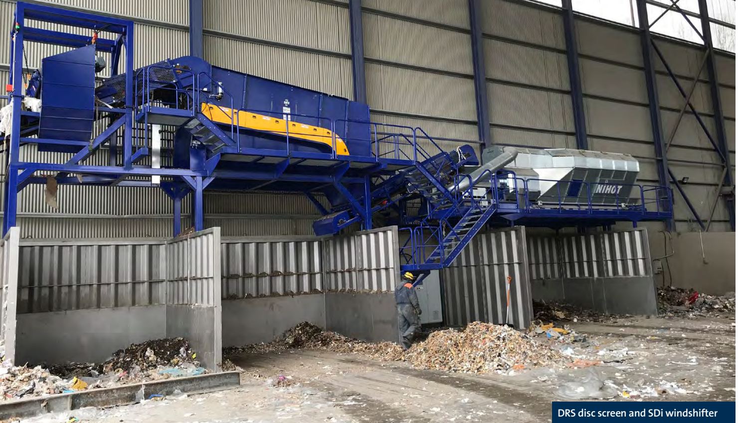
DRS disc screen and SDi windshifter