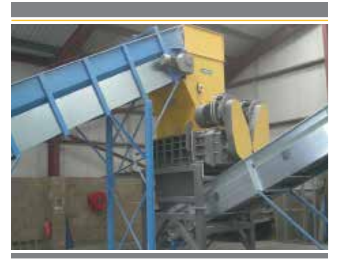
Over 40 years of expertise. More than 9,000 shredders in daily operation!